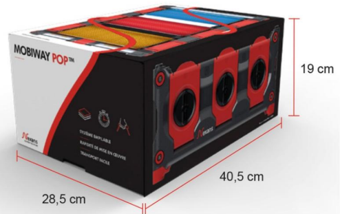
Caja Sistema MOBIWAY™ POP