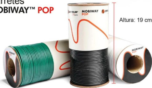
Carretes MOBIWAY™ POP